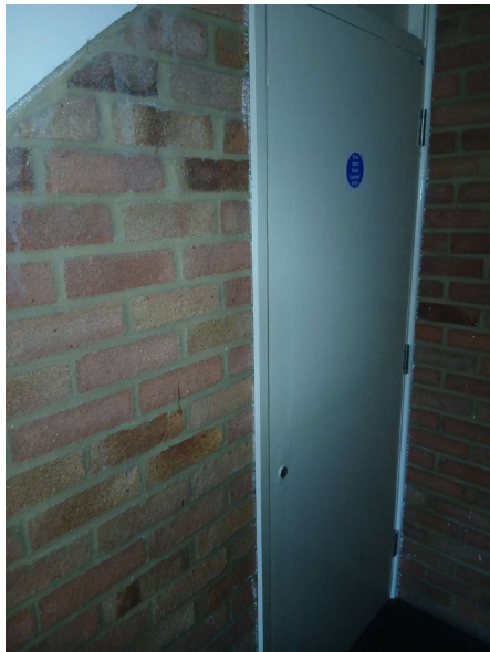
Cupboard Doors (Electrical Cupboard Doors)