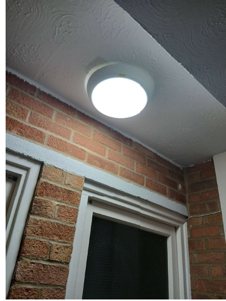
Lighting (Standard and Emergency Lights)