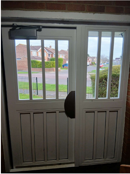
Entrances (Main Doors)