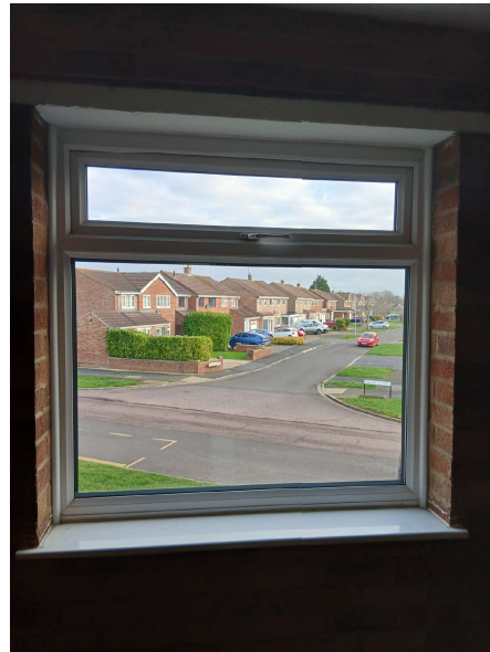
Windows (Communal Windows)